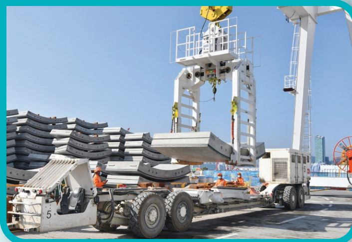
運送預製組件的多用途工程車，穿梭於物料存放區及隧道鑽挖機之間 Multi-purpose construction vehicle that shuttles between the material storage area and the TBMs for delivery of prefabricated components and materials